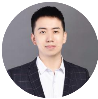
Xingjian Gao 高行健