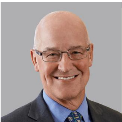
Andrew Hamilton President, New York University 纽约大学校长