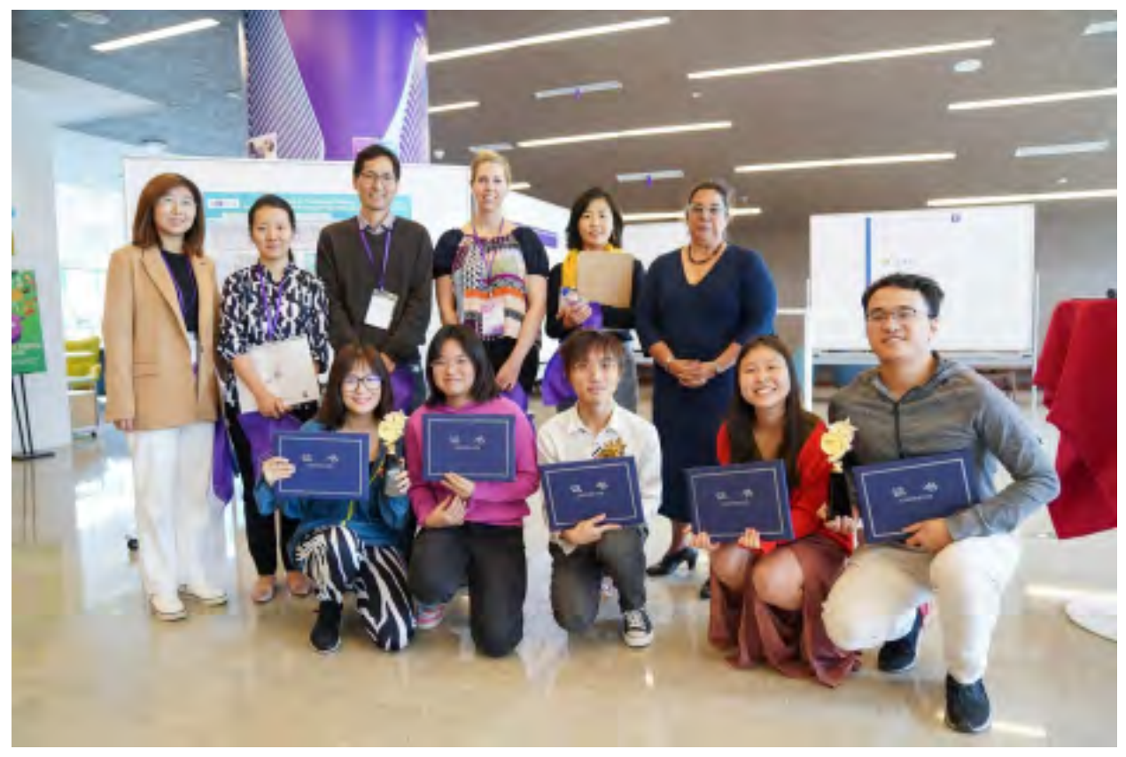
First Place Project

Project Title: Pika Park - Intelligent Parking Navigation System